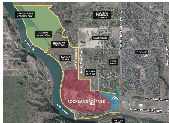
Figure 5 Haskayne Legacy Park

Boat access to the shore of Haskayne Legacy Park will not only allow for recreational outdoor pursuits on the reservoir but also offer a take-out point for floating the 25 Km reach of the Bow River between Cochrane and Calgary. This is one of the most beautiful stretches of the river to float within a reasonable distance of Calgary. Therefore, a new trailered boat access should be considered in the park development.