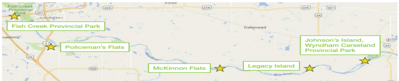
Figure 1: BRAP Scope of Development

The principal objective of the BRAP was to improve existing facilities within the scope of the planning area from the Fish Creek Provincial Park to Johnson's Island - Wyndham Carsland Provincial Park Weir (Figure 1). This has been accomplished with improvements to infrastructure at Policeman's Flats and a new road access and proposed river access improvements at McKinnon Flats. Upgrades and new boat ramps in the City of Calgary have also complemented an integrated river access further upstream to the Bearspaw Dam.