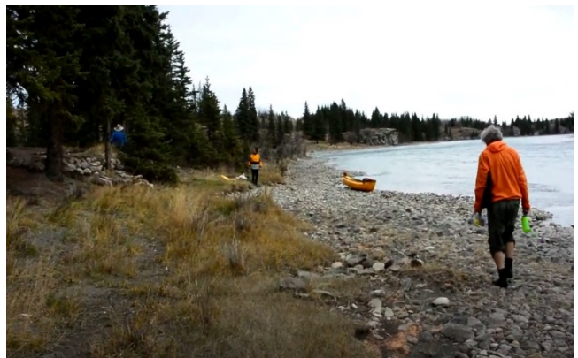
Figure 4 Wildcat Island Natural Area

Access to the Bow River is by use of the service road to the Wildcat Hill Gas Extraction Plant. In recent years, the road was closed to the public most likely due to liability and site maintenance issues. The provincial Wildcat Island Natural Area (Figure 4) is 1 Km further downstream of the historical service road access. The island is a common stopping-off site for the paddle community. Overnight camping and picnics are common at the property. The development of a public river access site at Wildcats should also be considered. Straight road allowances exist at RR54 & 53.