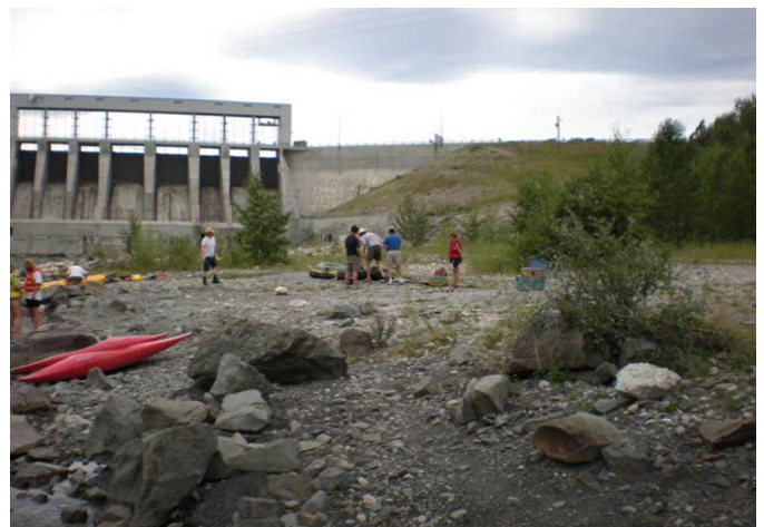
Figure 3 River Access below Ghost Dam.

It is CRUA's understanding that regulated access to the river edge is possible once liability and site maintenance issues are addressed. To secure vehicle access the service road would need to be upgraded and possible further restrictions for access put in place. The first step would appear to focus on foot access to the site. A stewardship-partnership agreement should be considered. CRUA and/or one of our member organizations will take the initiative to advance discussions with TransAlta.